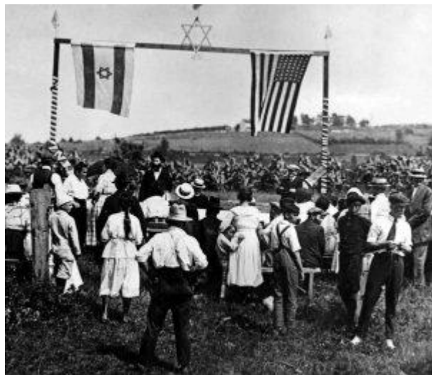
Image1: Photos of groundbreaking and completed building circa ~1914 and ~1920, respectively: