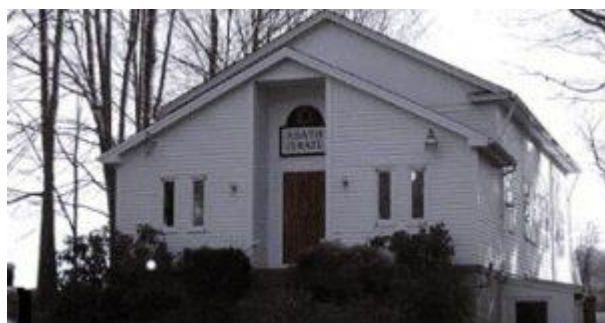
Image 2: Photos of renovated Synagogue on 111 Huntington Road circa ~1980s:

By the early 2000's it became clear that the building on 111 Huntingtown Road could no longer be practically maintained and serviceable for Congregation Adath Israel. On April 10, 2005 a groundbreaking ceremony was held to build a new synagogue and school just two building lots away at Congregation Adath Israel's present home of 115 Huntingtown Road – with the land again being donated by the generous descendants of the original founders.